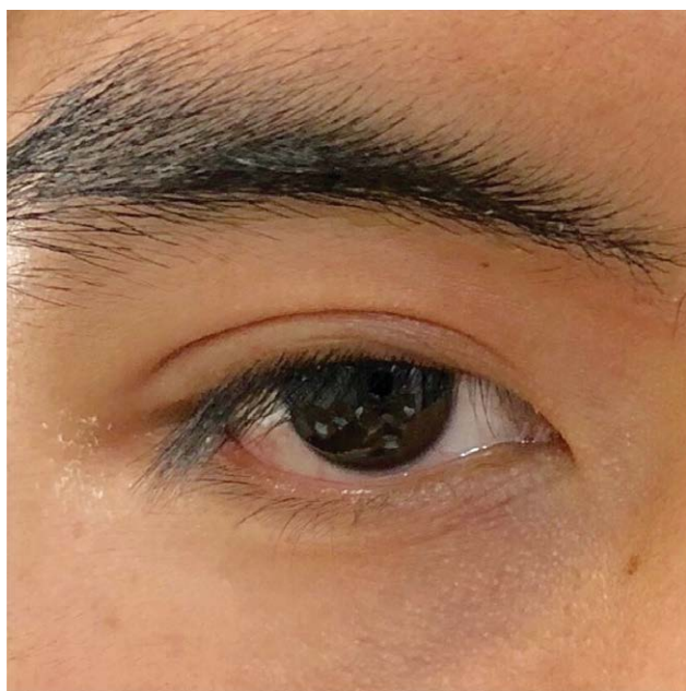
Fig. 2. Twenty-three-year-old man 2 years after “partial incision anchoring blepharoplasty” with verified history of using three buried 7-0 nylon sutures per eyelid. Crease height of RUL measured 8 mm centrally, and anatomic tarsal height was 7.5 mm. Deep crease is apparent on downgaze. Chief complaints were of eye strain, headaches, and occasional duplication of crease. (The verified record of the use of buried nondissolvable sutures to levator aponeurosis is consistent with level 6 construction.)